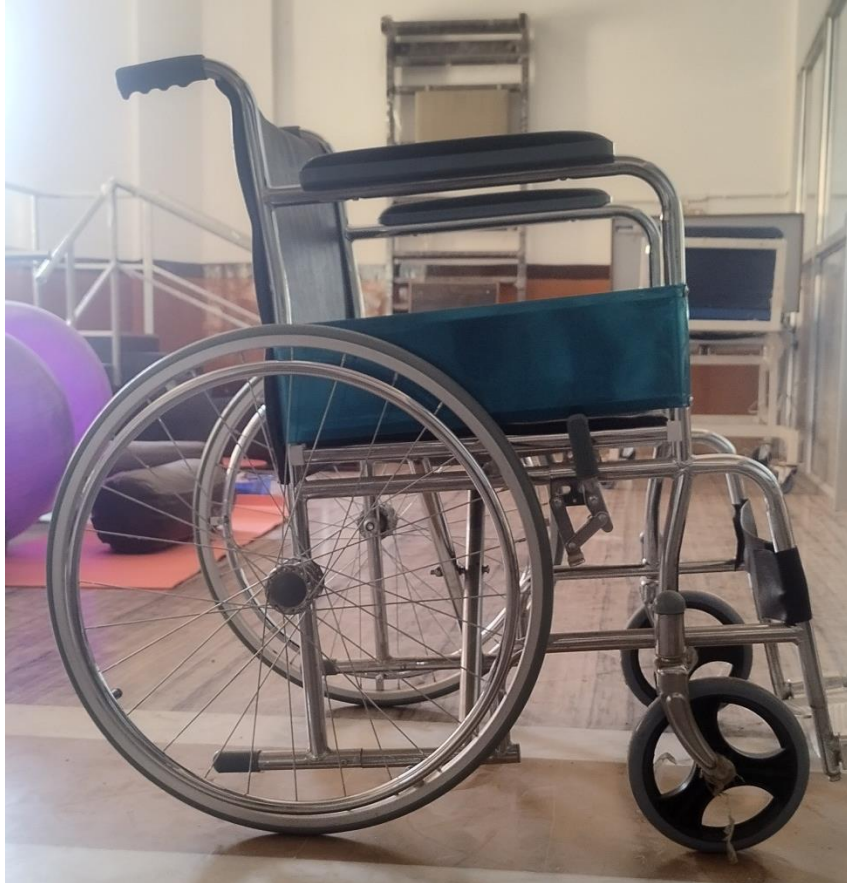
Human Assistance for physically challenged