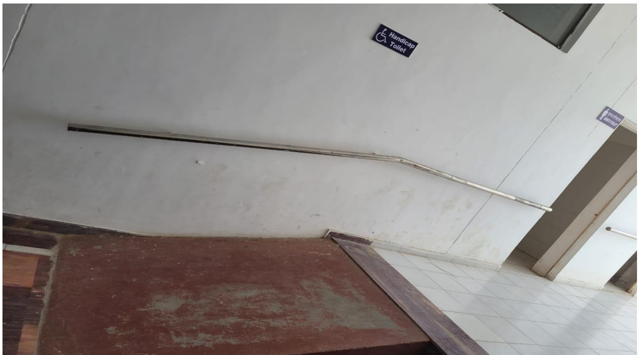
Divyaangjan Friendly Washrooms