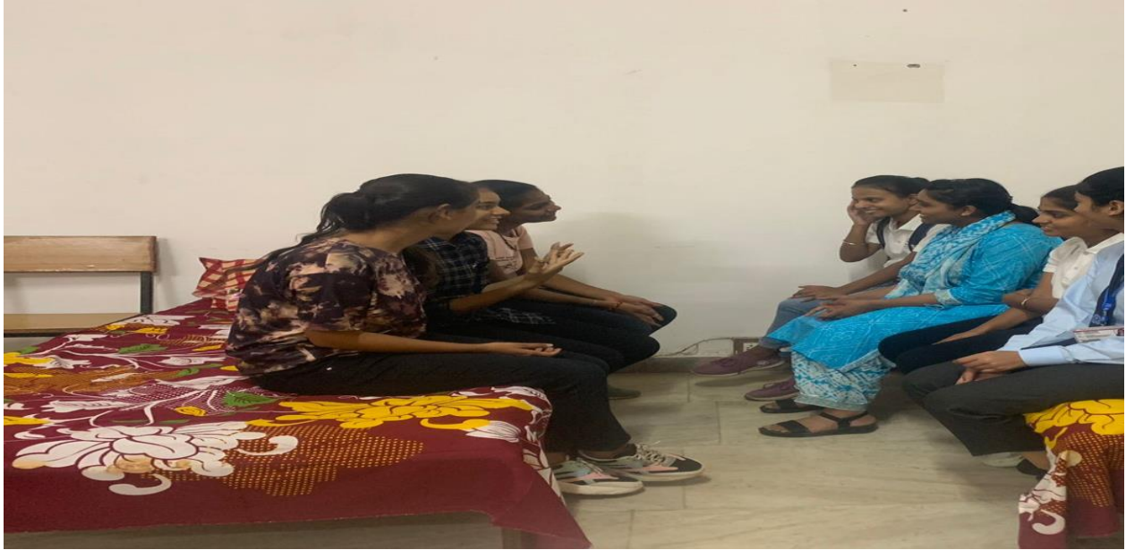
Regular Counselling Session of Girls