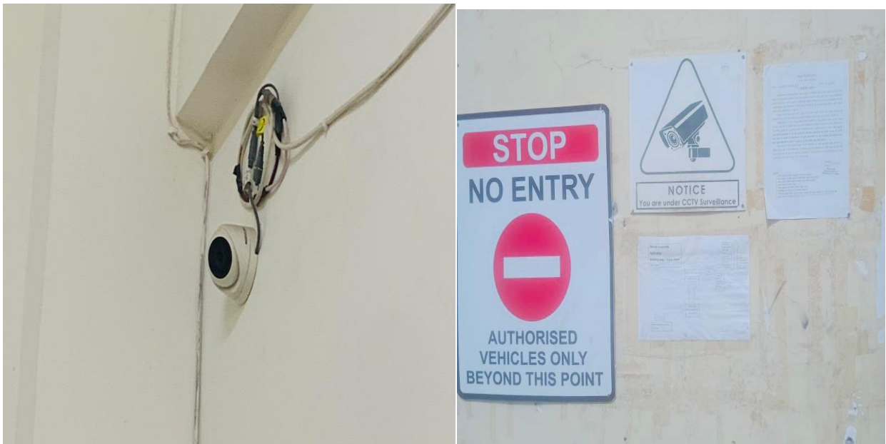
411 CCTV Cameras installed in the campus with some cameras capturing audio for security