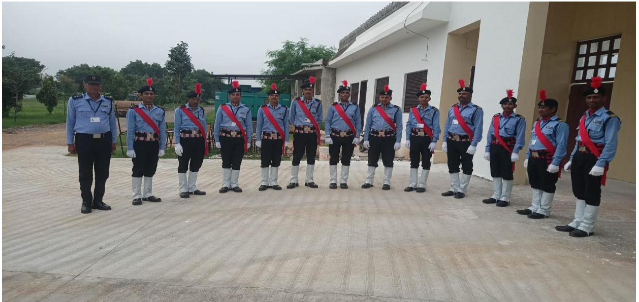
Security Guards available 24*7 in the university campus