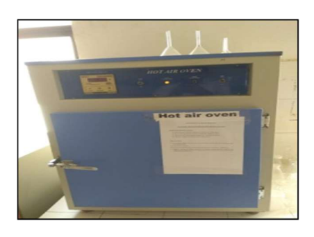
Hot air oven