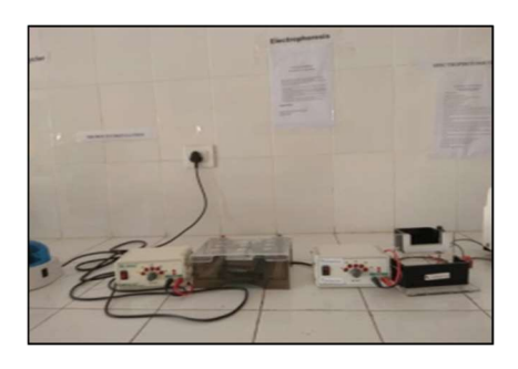
Gel Electrophoresis Unit