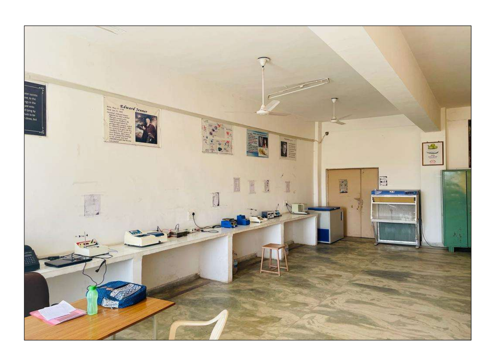
Microbiology & Biotechnology Lab