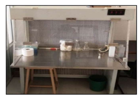
Laminar Air Flow